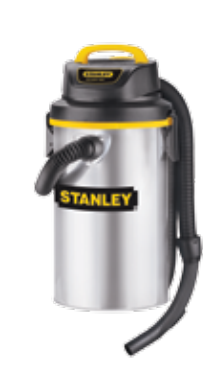
3.5 Gallon Wall Mount SKU 298478 SL18132 69 99