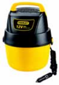
1 Gallon 12V DC Portable SKU 298456 SL18125DC 28 99