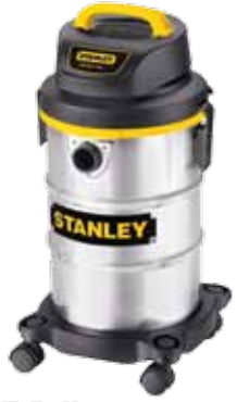
5 Gallon SKU 972789 SL18130 59 99