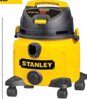
7 Gallon Portable SKU 298444 SL18015P 89 99