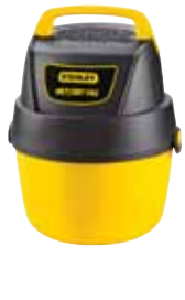
1 Gallon Wall Mount & Portable SKU 972787 SL18125P 29 99