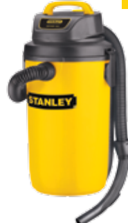
4.5 Gallon Hang-Up SKU 972790 SL18133P 69 99