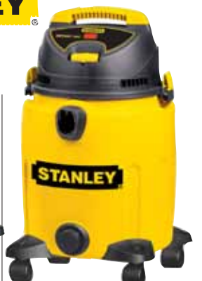
10 Gallon Portable SKU 972794 SL18014P 99 99