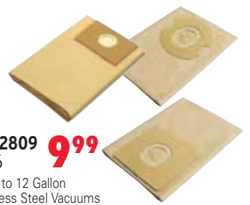
SKU 972809 13-1516 9 99