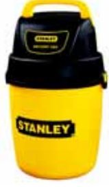
2 Gallon Wall Mount & Portable SKU 298474 SL18127P 39 99