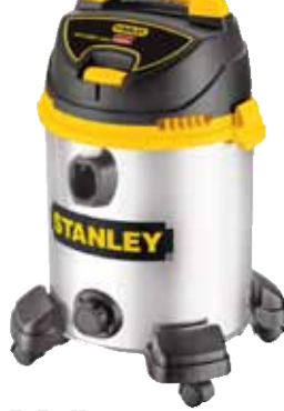
8 Gallon SKU 972792 SL18017 89 99