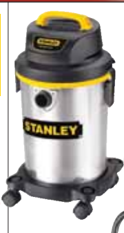
4 Gallon SKU 298476 SL18129 54 99