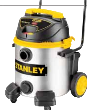
14 Gallon SKU 298383 SL18012 159 99