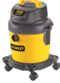
3 Gallon Portable SKU 298475 SL18128P 44 99