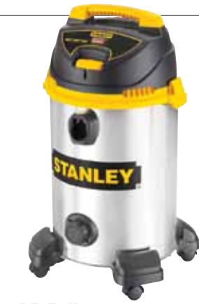
10 Gallon SKU 298392 SL18014 119 99