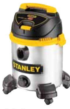
6 Gallon SKU 298446 SL18016 84 99