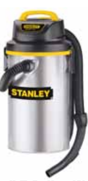
4.5 Gallon Wall Mount SKU 298479 SL18133 79 99