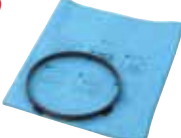
Foam Filter SKU 972810 25-1202 3 99