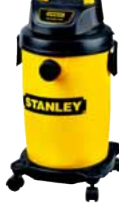
4.5 Gallon Portable SKU 298477 SL18130P 59 99