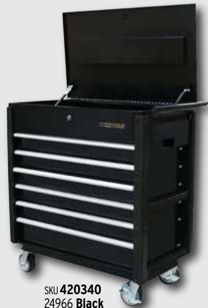
SKU 420340 24966 Black