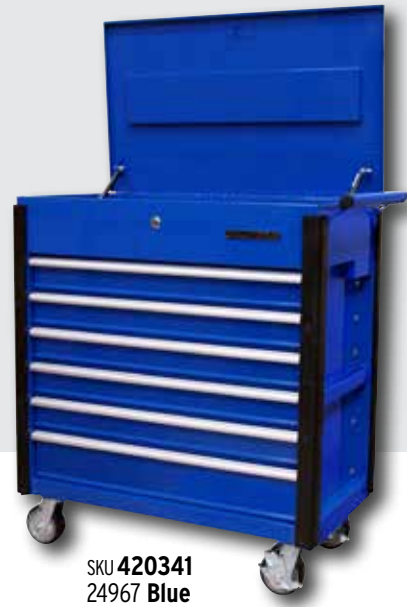
SKU 420341 24967 Blue

Offer Good Through September 30, 2015 - While Supplies Last