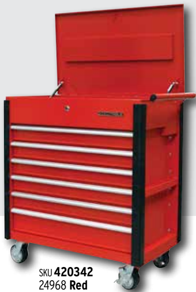
SKU 420342 24968 Red