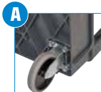
A Smooth Rolling, Non-Marring 5" Casters