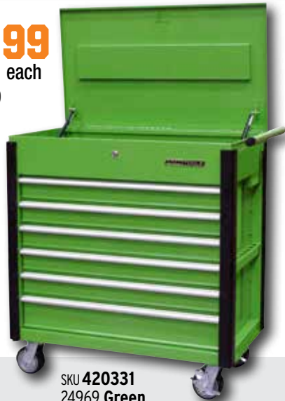
SKU 420331 24969 Green

OEMTool's Professional Service Carts Feature Injection Molded Corner Bumpers to Protect Vehicles and Other Objects in Your Shop