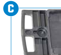
C Convenient Organizer Tray and Cup Holder Built Into Handle