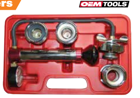
WORKS WITH THE CEMTOOLS ADAPTERS BELOW