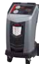
SKU751572 ROB34788NI-H $3899.99