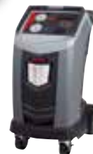
SKU751569 ROB34788NI $3799.99