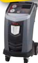
SKU344607 ROB34988NI $4899.99