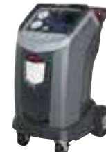
SKU751575 ROBAC1234-6 $6399.99