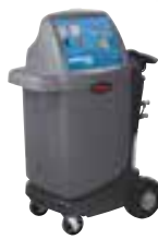
SKU221185 ROB34288 $2899.99