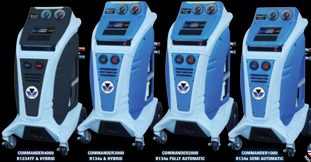
COMMANDER4000 R1234YF & HYBRID

Navigate through all functions, features and instructions with ease. Wi-Fi capabilities allow for real time, interactive communication and troubleshooting.