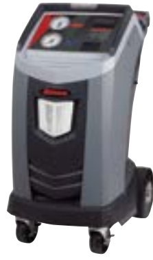
SKU 751572 ROB34788NI-H 3,899 99