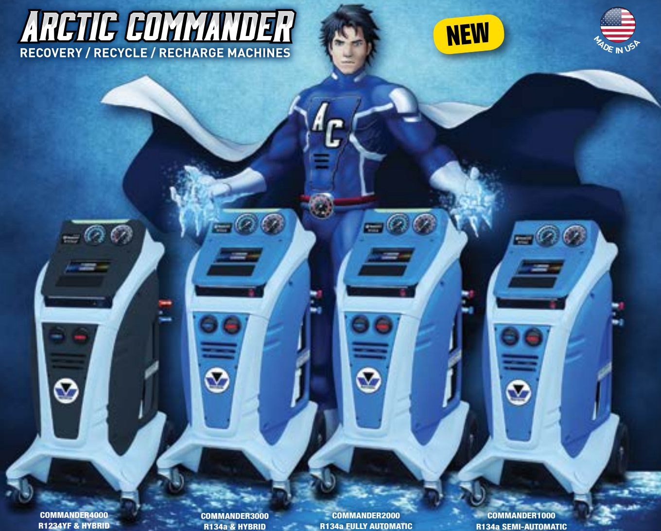
COMMANDER4000 R1234YF & HYBRID