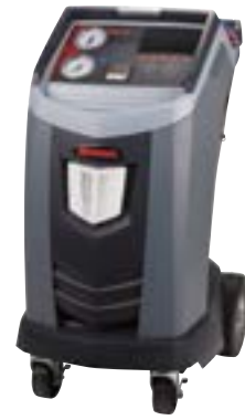
SKU 377607 ROB34988NI 4,899 99