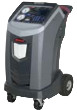
SKU 751575 ROBAC1234-6 6,399 99