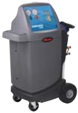
SKU 221185 ROB34288 2,899 99