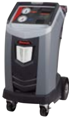
SKU 751569 ROB34788NI 3,799 99