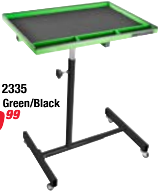
SKU 912335 24934 Green/Black 89 99