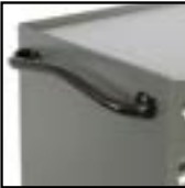
C4 Sandblasted Aluminum Trimmed Drawer Pulls