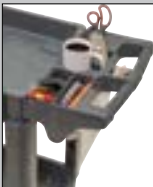
Cup and supplies not included.