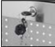
Color Coded Flat Key Locking System