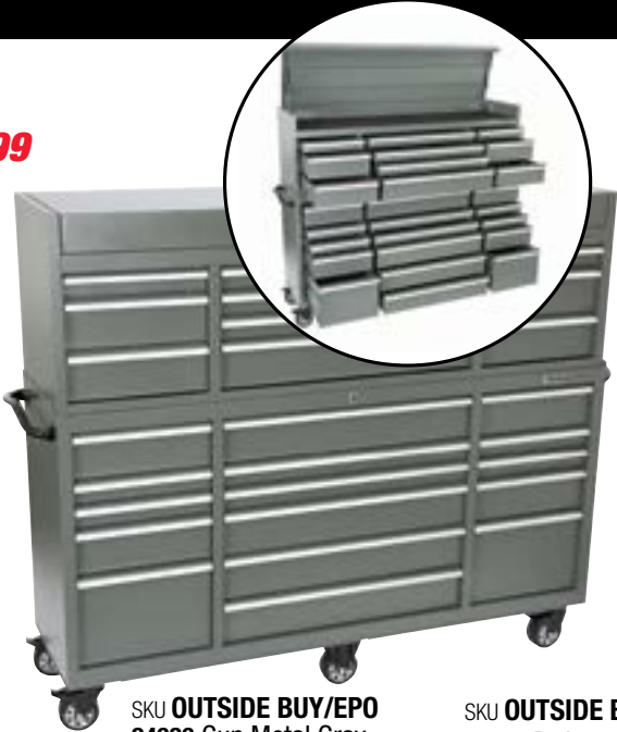
SKU OUTSIDE BUY/EPO 24626 Gun Metal Gray

Available via Outside Buy/EPO, Call 1-877-298-6651 for Ordering Instructions