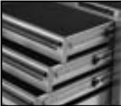
Full Extension 100 Lbs. Capacity Slides