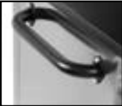
Black Aluminum Drawer Pulls