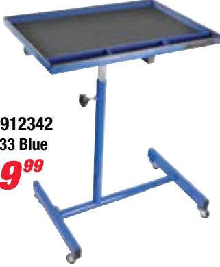
SKU 912342 24933 Blue 89 99