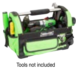
Tools not included