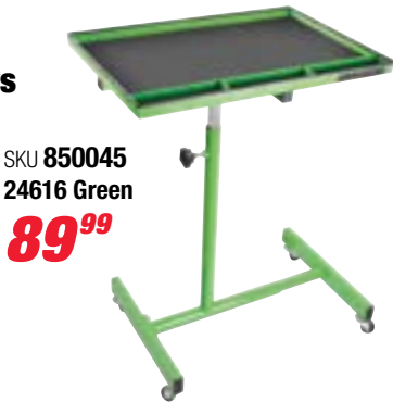
SKU 850045 24616 Green 89 99