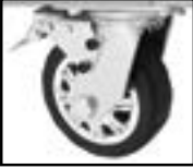
5" x 2" Heavy Duty Casters