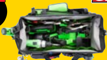
Tools not included