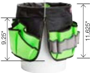
Tools and Bucket not included