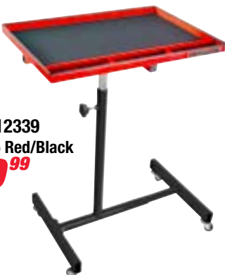
SKU 912339 24935 Red/Black 89 99