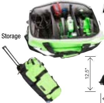
Tools not included