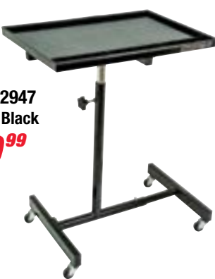
SKU 512947 24960 Black 89 99