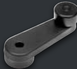
Exterior & Interior Cab Parts