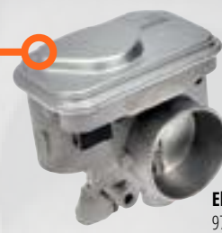
Electronic Throttle Body 977-025