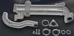
EGR Valves & Coolers