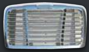
Exterior Crash Parts