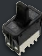
Switches (All Types)