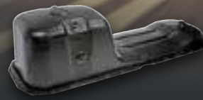
Engine, Suspension & More