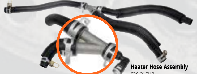
Heater Hose Assembly 626-315HP