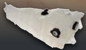
Fluid Reservoirs (Caps & Sensors)