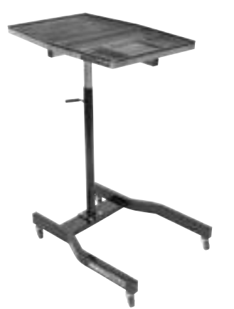
• Free Delivery in 48 Continental United States • Specifications Subject to Change without Notice or Liability. Prices Do Not Include Vehicles, Installation or Optional Equipment as Shown. • Customers Responsible for Off-Loading Equipment Upon Arrival. Ask Your Sales Rep for Details. • Leasing Terms Available. Ask Your AutoZone® Commercial Sales Manager