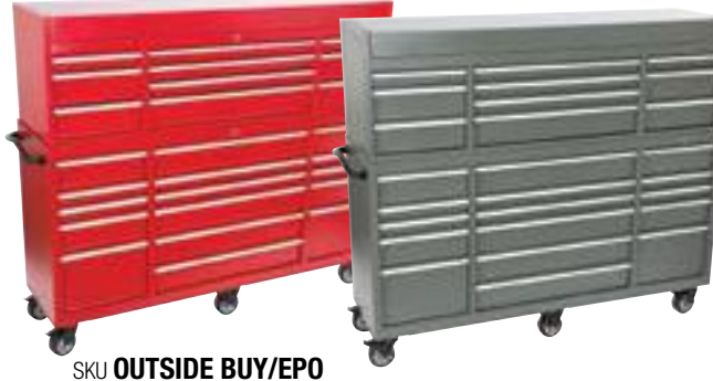
24626 Gun Metal Gray