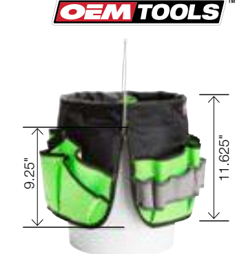
Tools and Bucket not included