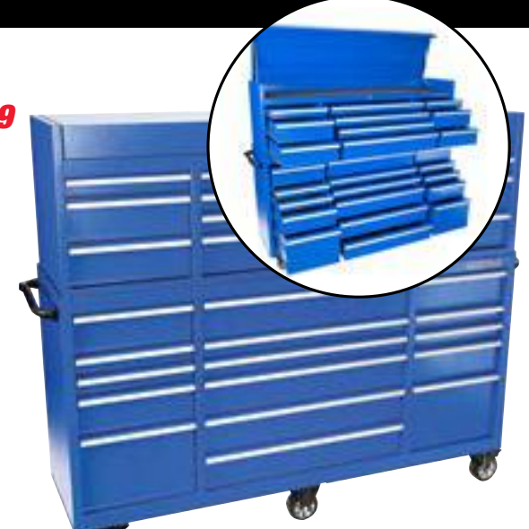
SKU OUTSIDE BUY/EPO 24629 Blue

Call 1-877-298-6651 for Ordering Instructions