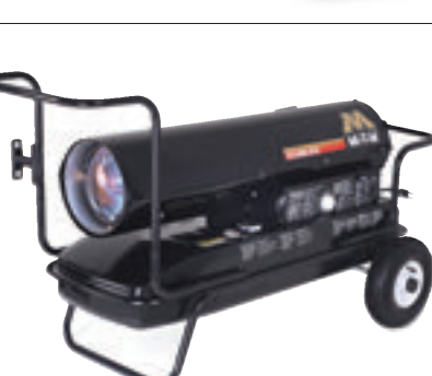
215,000 BTU Kerosene Forced Air Heater али 410058 МТММН0215М10 49999

175.000 BTU Kerosene Forced Air Heater ыли 410057 МТММН0175М10 44999