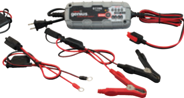
6/12 Volt 1100mA Battery Charger & Maintainer SKU 388465 | G1100