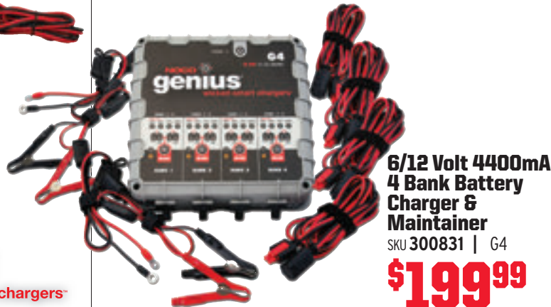
6/12 Volt 4400mA 4 Bank Battery Charger & Maintainer SKU 300831 | G4