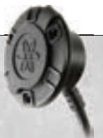
13A 125 Volt AC Port Plug SKU 227339 | GCP1