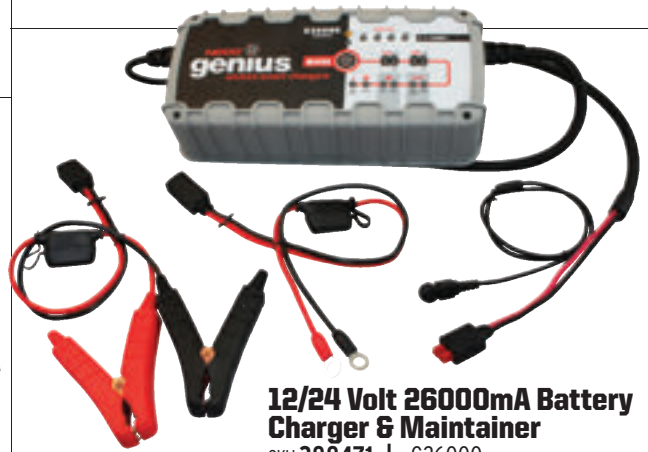
12/24 Volt 26000mA Battery Charger & Maintainer SKU 388471 | G26000