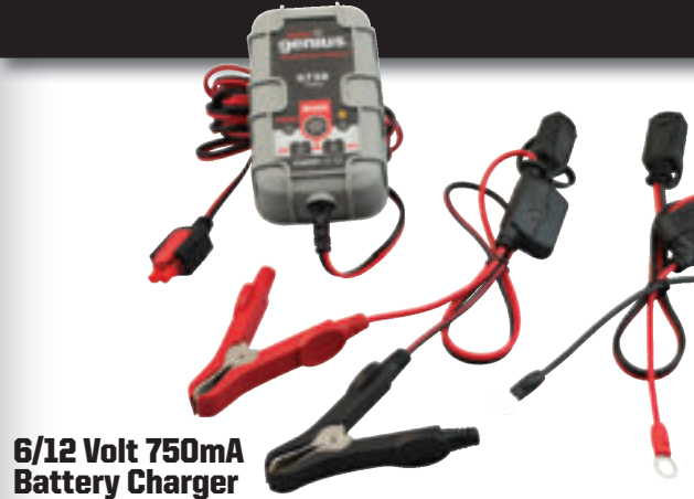
6/12 Volt 750mA Battery Charger & Maintainer SKU 388458 | G750

They can restore batteries to their original capacity, recover slightly sulfated batteries, charge batteries in cold climates, rescue drained batteries and provide maintenance charging to increase battery life. Versatile chargers that, throughout the range, can provide charging and maintenance for 6V, 12V, and 24V batteries ranging in size from 1.2Ah to 500Ah. NOCO Genius chargers are fortified with several unique safety features to protect you, your battery and the battery charger. Our smart processor utilizes sophisticated levels of intelligence to alter the charge process based on organic feedback from the battery to extend battery life, quickly and efficiently making decisions on how to charge the battery without risking user safety or battery damage.