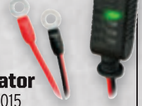
12 Volt Eyelet Battery Indicator SKU 300832 | GC015