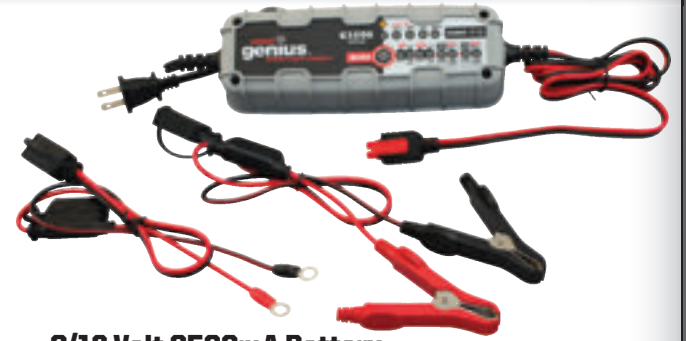
6/12 Volt 3500mA Battery Charger & Maintainer SKU 388469 | G3500