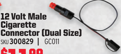
12 Volt Male Cigarette Connector (Dual Size) SKU 300829 | GC011