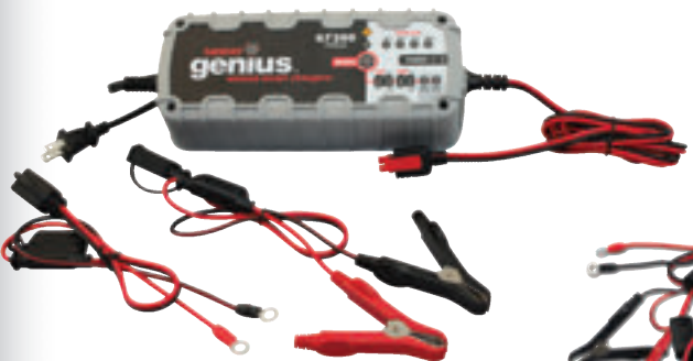
12/24 Volt 7200mA Battery Charger & Maintainer SKU 388470 | G7200