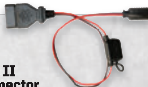
OBD II Connector SKU 300830 | GC012