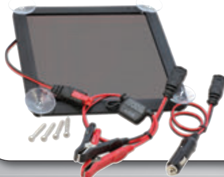
12 Volt 5.0 Watt Solar Battery Charger & Maintainer SKU 300833 | BLSOLAR5