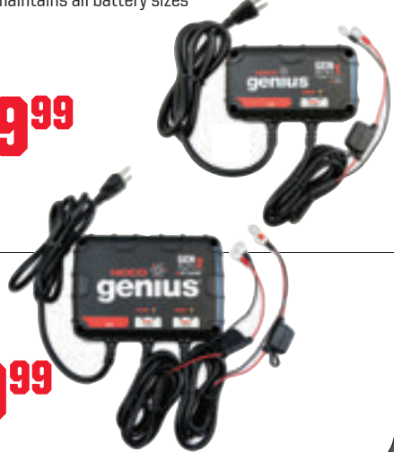
12 Volt 8A 2 Bank Mini On Board Battery Charger & Maintainer SKU 300835 | GENM2