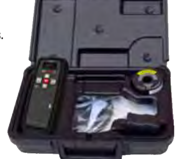
OBD Cable and Connector